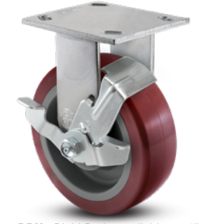
BRK7 Rigid Brake available on 4", 5", 6" and 8" rigid models