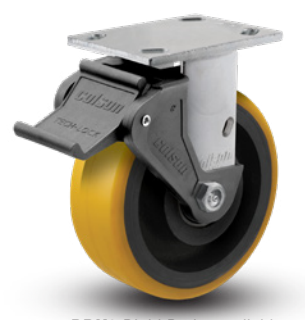
BRK2 Rigid Brake available on 6" rigid models

Colson Brake Kits should be used with the new CG-RIGID models if a brakes are desired. Specify BRK3 and BRK7. The 6" Rigid Tech Lock BRK2 also works (see photos below)